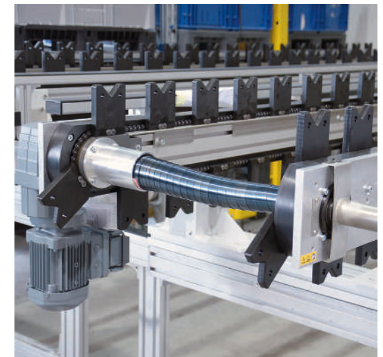
TKU 2040 for transporting camshafts with a spiralled cover as a protective guard on the connecting shaft