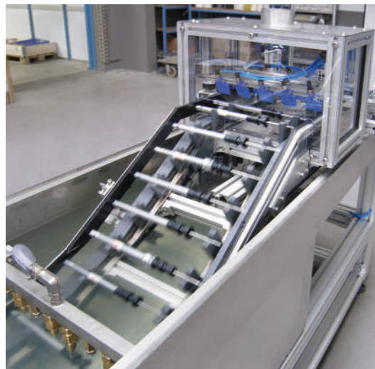
TKU 2040 with 20° inclination and transport of workpieces through a cleansing bath