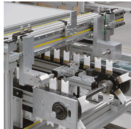
TKU 2040 for transporting camshafts with positioning sensors