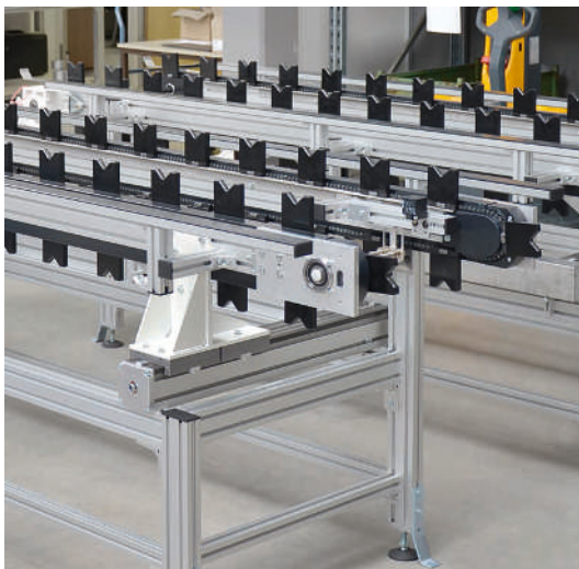
TKU 2040 with special adjusting unit for adjusting the distance between the conveyor chains