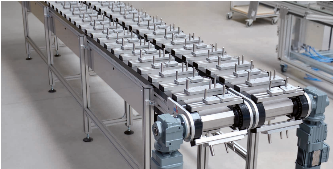
TKU as dual-line system with custom profile pallets and holders